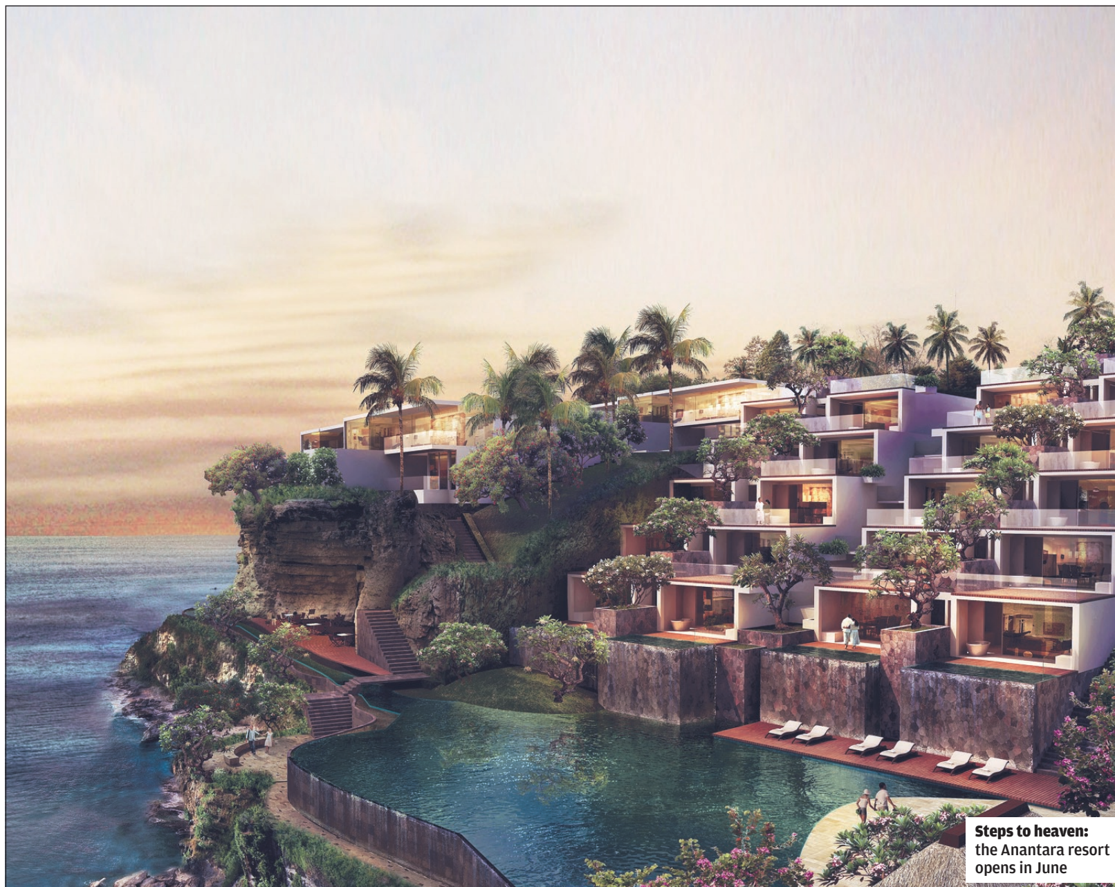
Steps to heaven: the Anantara resort opens in June